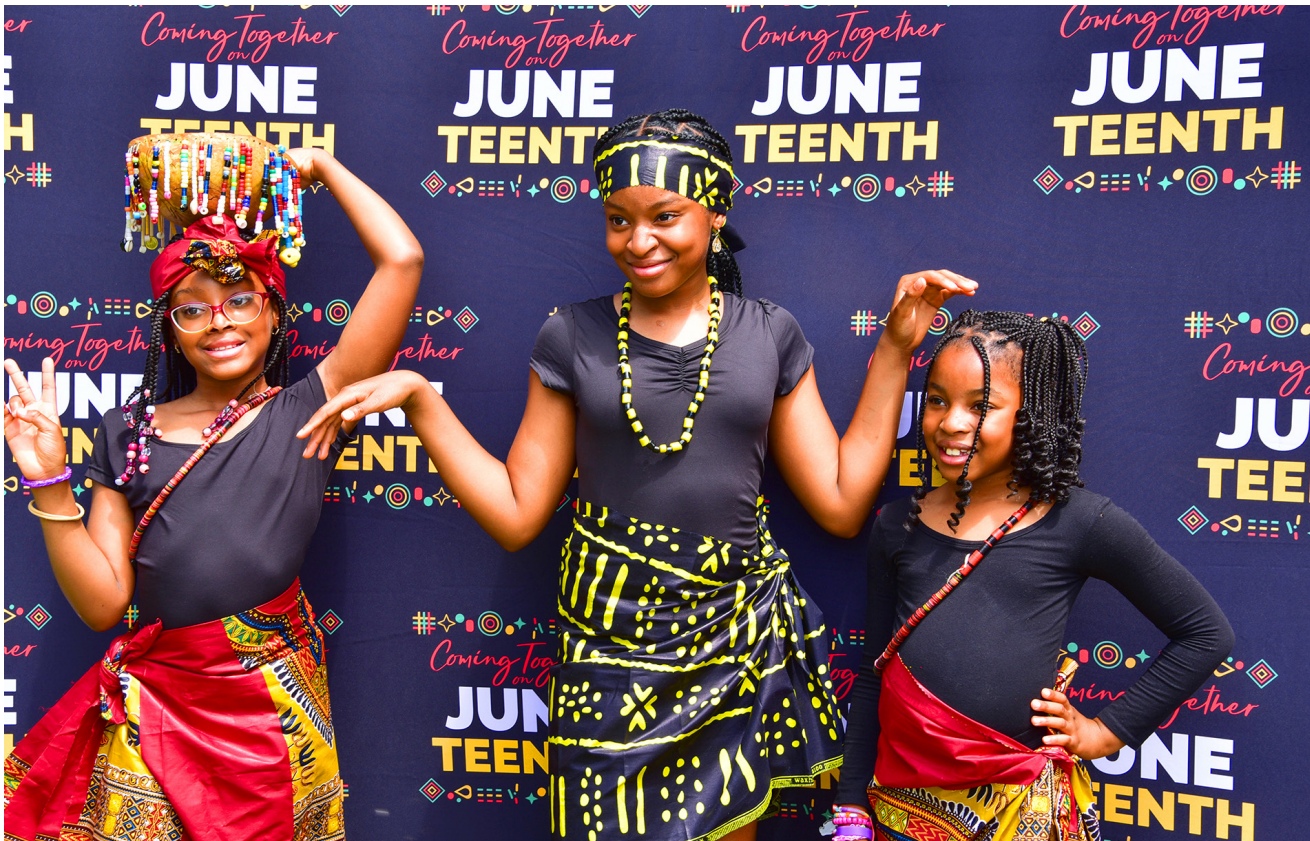
Coming Together on Juneteenth