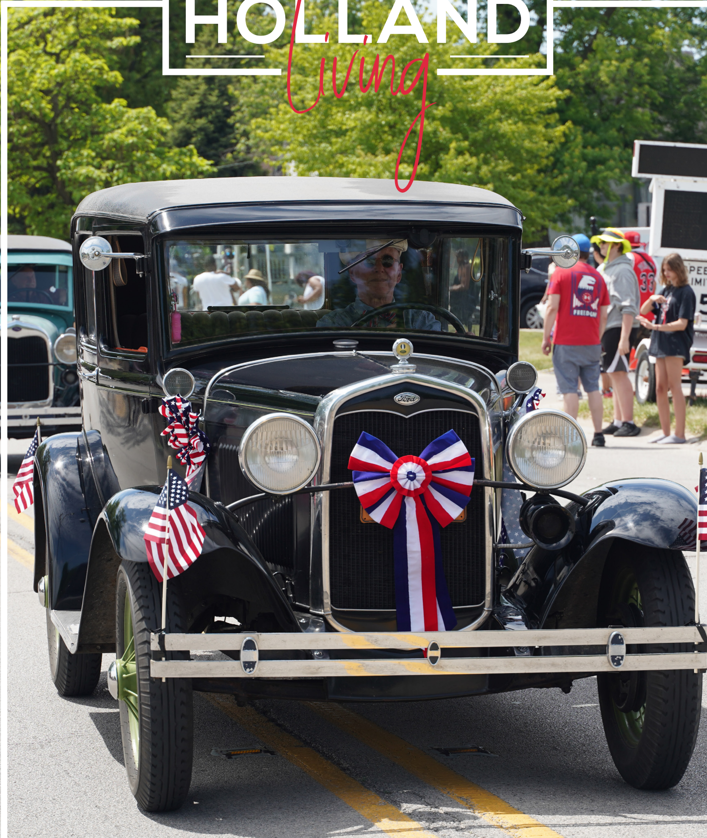
The Kickoff to a South Holland Summer