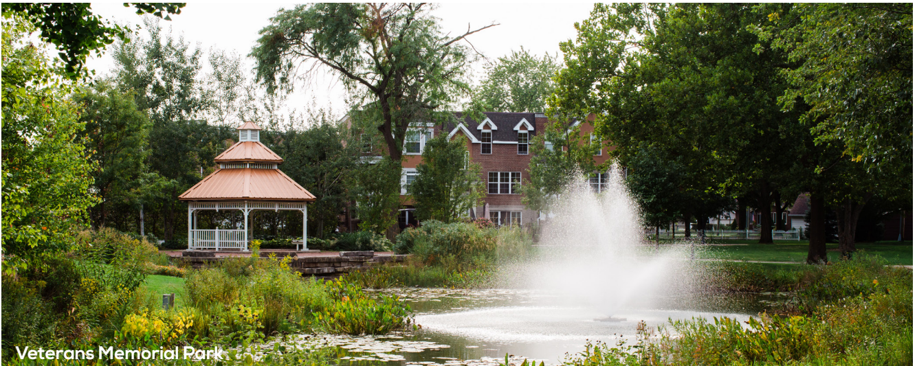
Veterans Memorial Park

EVERYTHING TO KNOW ABOUT SOUTH HOLLAND'S 30 PARKS