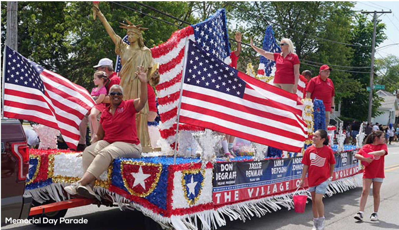
Memorial Day Parade