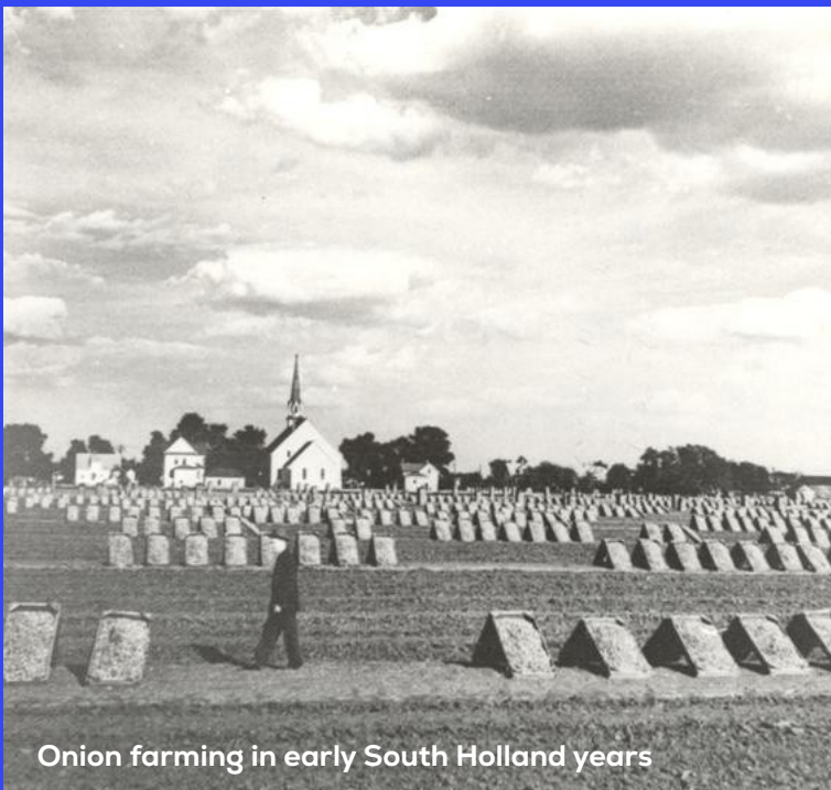
Onion farming in early South Holland years

It distinguished the area from Hooge (High) Prairie, which was another Dutch settlement that later became Chicago's Roseland area.