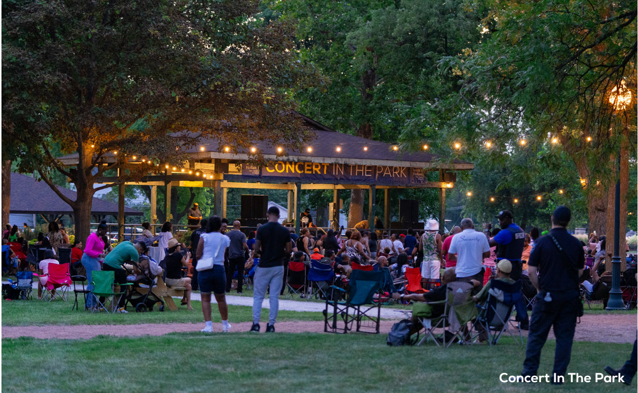
Concert In The Park